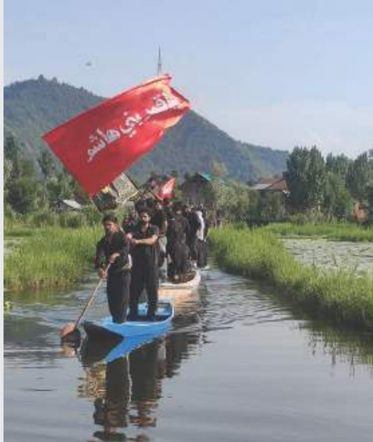
of Dal Lake, the annual procession transforms its quiet interiors into a sea of mourning. Black flags flutter above narrow wooden bridges

"Our forefathers followed these same routes decades ago. Every Ashura, we retrace their footsteps in remembrance of Imam Hussain (AS)," he said. Far from the tourist image