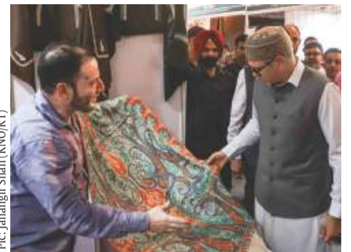
four years to achieve it. While we have to support those who are already exporting, we also need to create exporters out of people who are not exporting today and whose markets are presently confined to Jammu and Kashmir or, at best, some parts of the country. Our effort is to make exporting easier for them," the CM said. The Chief Minister said Jammu and Kashmir has historically been an exporter, though not through conventional export channels. "Traditionally, particularly in Kashmir, our | More on P6

CM Omar, who was the chief guest on the occasion, said, "As the Government of India has set a target of doubling exports by 2030, we have only