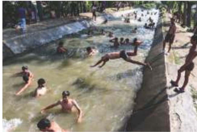
other places in Kashmir also recorded temperatures well above normal. Qazigund registered 33.8°C, around 5°C above normal, while Kokernag recorded 32.9°C, around 5°C above normal. Kupwara settled at 32.7°C, Pahalgam at 29°C, and Gulmarg, usually known for its cool | More on P6