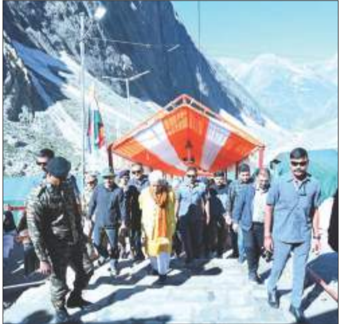
Volunteers are working in complete synergy. Every stakeholder is devoted to ensuring a safe,

He said, "As the Yatra commences on July 3rd, Administration, Shri Amarnath Ji Shrine Board, Army, Police, Security Forces, Local Community, Service Providers,