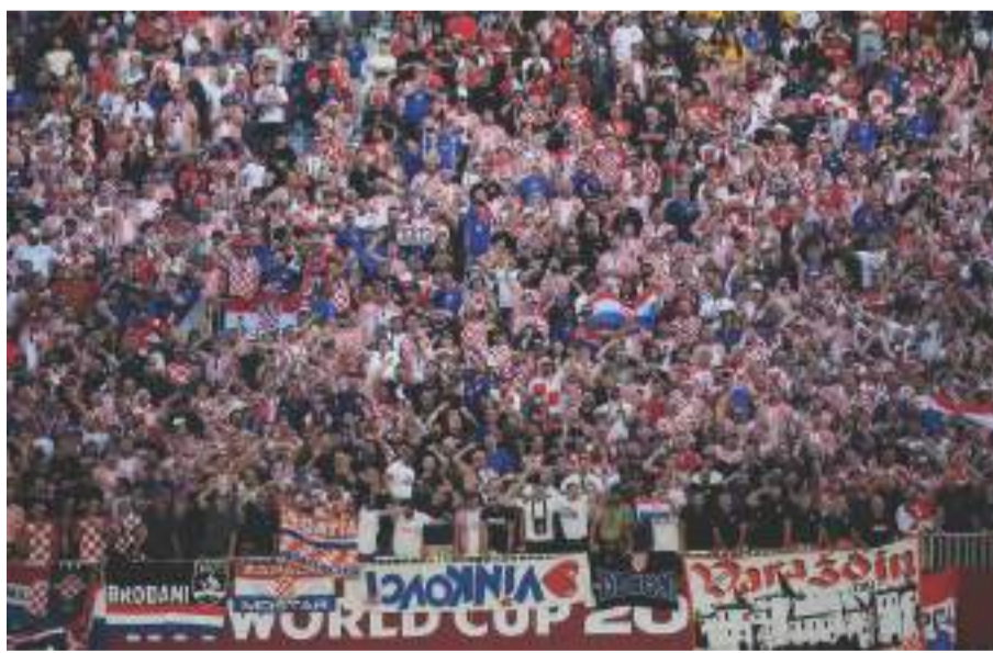
Fans of Croatia celebrate at the end of the World Cup Group I soccer match between Panama and Croatia in Toronto, Tuesday, June 23, 2026.

Co-experienced Positive Emotions. Positive emotions are one of the five