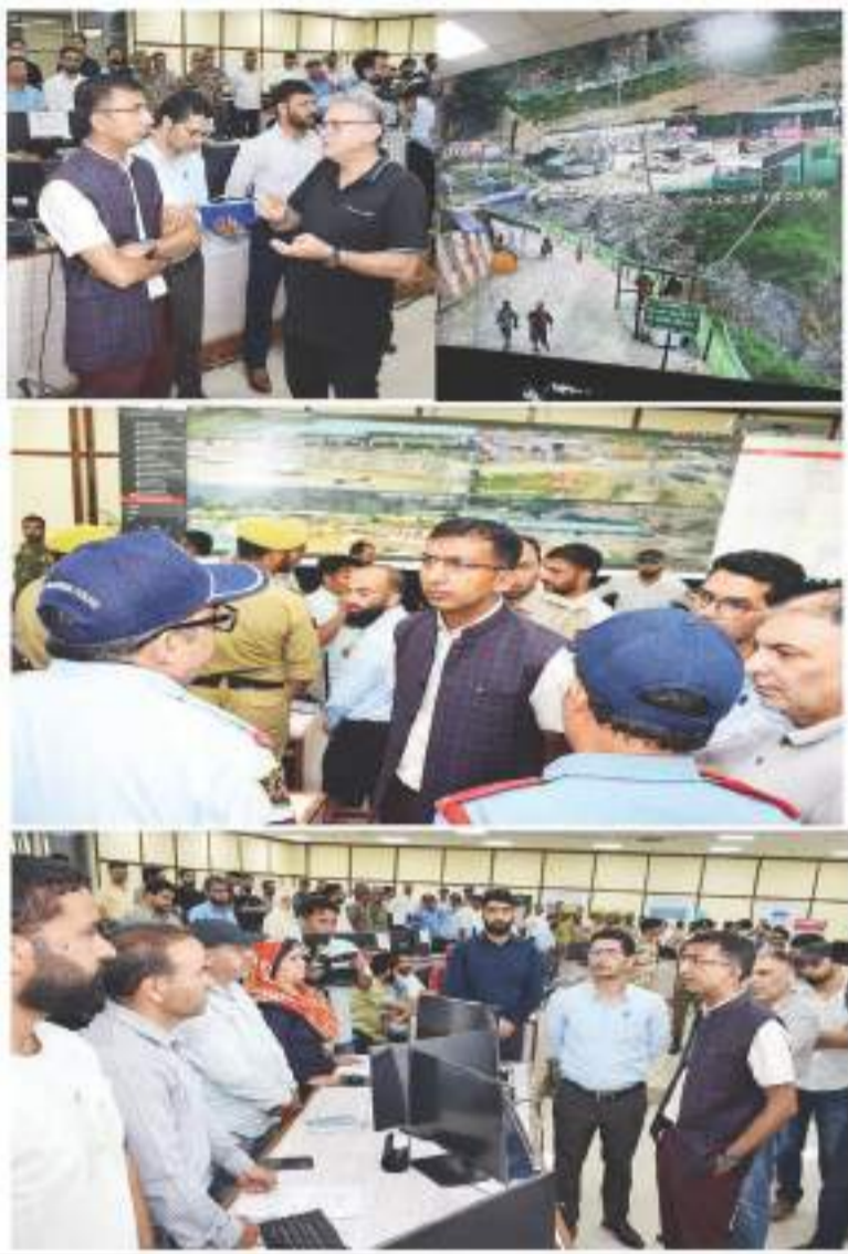
KT News Desk

Emphasizes round-the-clock monitoring, data compilation, dissemination of information