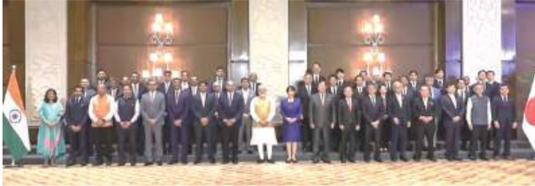
Ministry Spokesperson Randhir Jaiswal posted on X.

"A memorable visit concludes, advancing India-Japan partnership towards shared horizons. PM @takaichi_sanae of Japan departs from India following the highly successful 16th India-Japan Annual Summit. She was seen off by Minister of State @DrjtiendraSingh," External Affairs